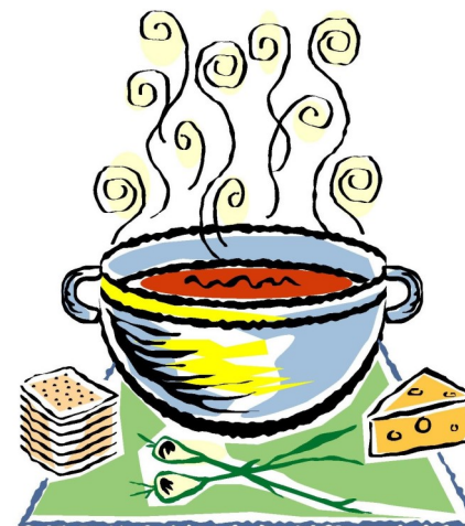
Soup Luncheon and Quarterly Business Meeting